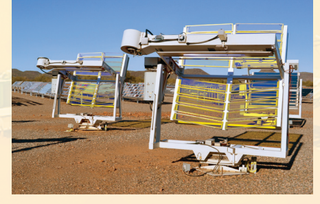
The Atlas network of natural weathering facilities is the largest in the world serving over 2,000 clients in 40 countries.

testing is essential to ensuring you're covered against costly liability issues. Realistic simulation of natural weathering conditions is key to receiving good correlation from accelerated testing. Better control of test parameters helps to increase reproducibility. The Atlas standardization team is implementing these approaches into test method development with the goal to develop better international standards (ISO, IEC, ASTM, CEN).