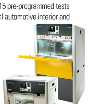
SUNTEST XXL+ and XLS+

SUNTEST® Series – best-in-class xenon testing for 3-D specimens — As of January 1st, 2024, our XLS+ and XXL+ models have undergone an attractive upgrade, now featuring three helpful Ethernet-supported online features: Remote Control, E-Mail Service, and Online Monitoring. Stay connected to your SUNTEST!